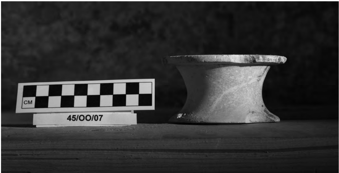
Fig. 1 The travertine vessel discovered in the tomb of Neferinpu (AS 37) at Abusir South